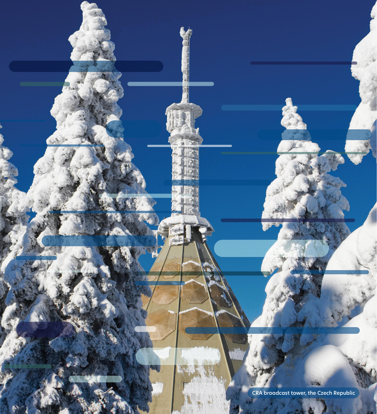
CRA broadcast tower, the Czech Republic

Cordiant Digital Infrastructure Limited / LSE: CORD / June 2022